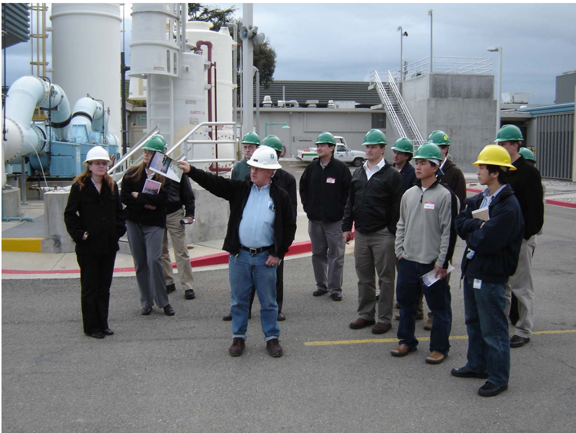
"Young Members" getting an introduction to CCCSD's Wastewater Treatment Plant